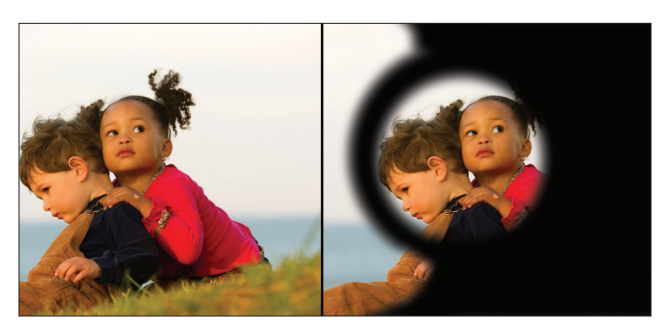
A normal visual field is represented in the image on the left. The image on the right is an example of severely damaged vision.

These grids are results of visual field tests. The dark black shaded areas show where loss of vision has occurred.