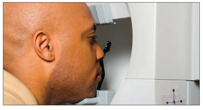
Visual field testing is used to monitor peripheral, or side, vision.

Your ophthalmologist will interpret the results of your test and discuss them with you.